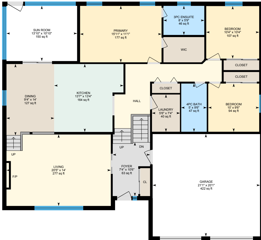
Main Floor Exterior Area 1585.01 sq ft

Main Building: Total Exterior Area Above Grade 1585.01 sq ft