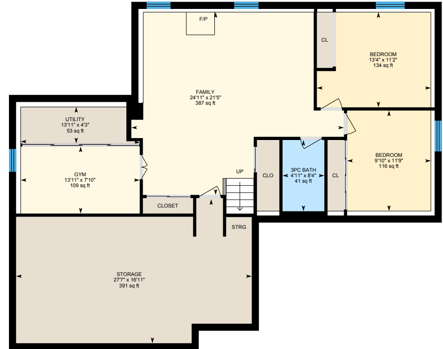
Basement (Below Grade) Exterior Area 1509.70 sq ft